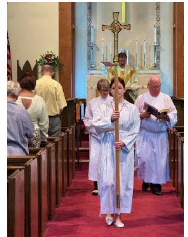
Some recent photos from around our church.