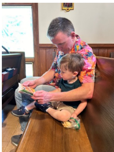
Taken on Father's Day ❤️