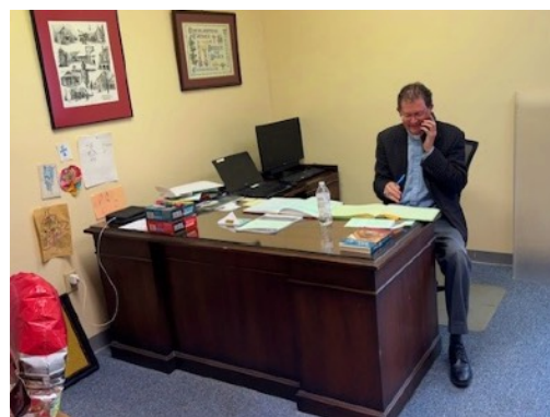
Some recent scenes around our church . . .