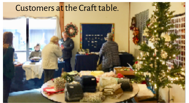
Customers at the Craft table.