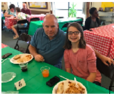
EYC Spaghetti Lunch continued ... on next page