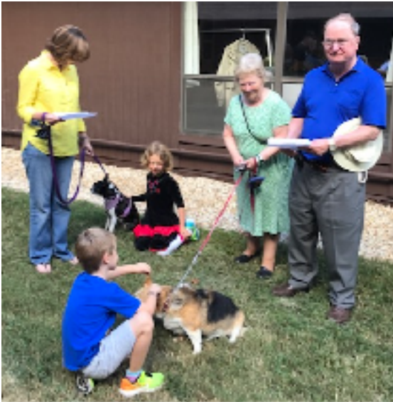
Blessing continued... from previous page