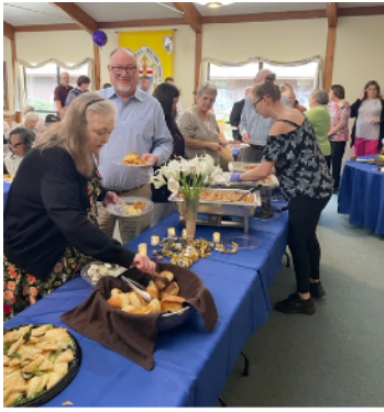
60th Celeb. continued ... from previous page