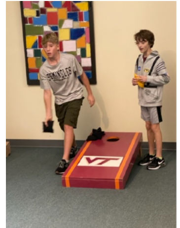
What some members do for the church!