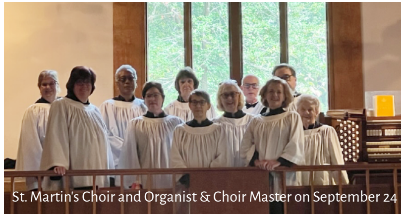
St. Martin's Choir and Organist & Choir Master on September 24