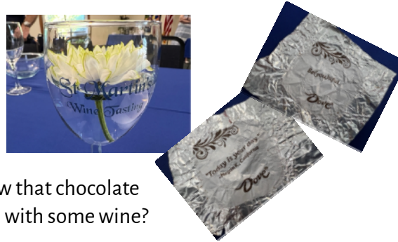
Who knew that chocolate pairs well with some wine?