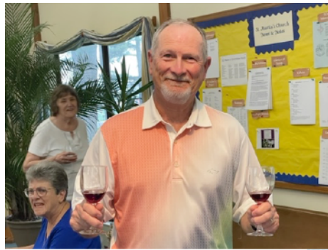
A great event enjoyed very much!