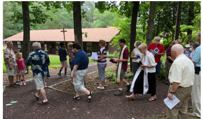
It continued at the St Francis statue.