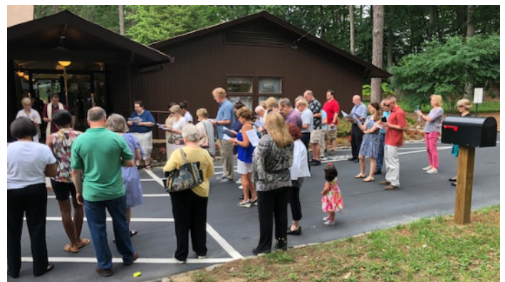
Outdoor Service continued ... on next page