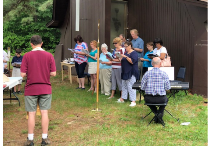
The Choir and organist!