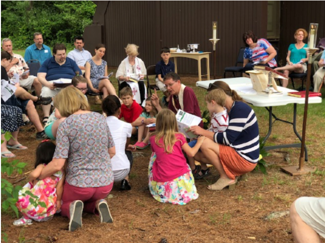
Yes, the children's sermon. They would miss it.