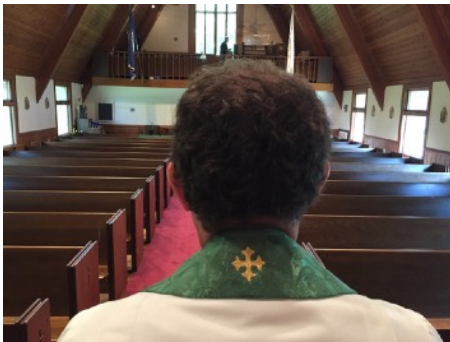
editor: photos taken after the service That's why the church looks empty.

In our church the color of the stole changes with the liturgical season. Purple in Advent and Lent, green in Epiphany and Pentecost, red during Holy Week and the day of Pentecost and white during Easter.