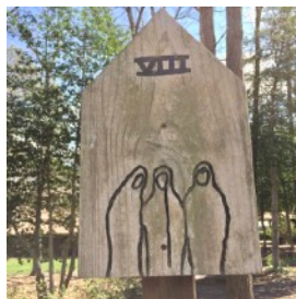
8. He meets the Women of Jerusalem