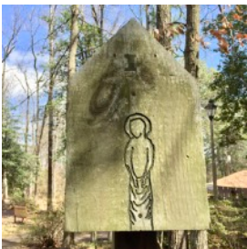
1. Christ is condemned to death