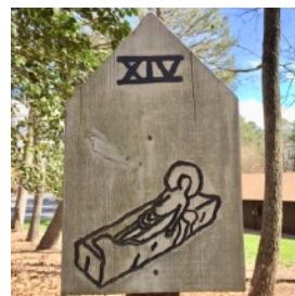
14. His body is laid in the tomb

These photos were taken in the St. Martin Memorial Garden, a place to rest and contemplate.