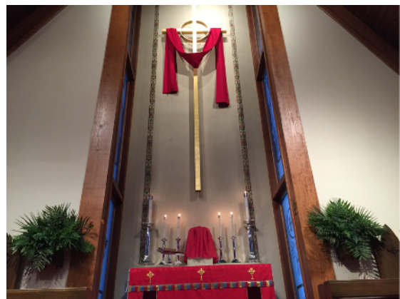
The Altar on Palm Sunday