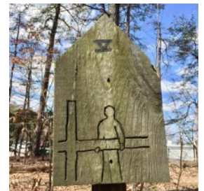
5. Simon of Cyrene is made to bear the cross