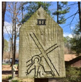
3. His 1 st fall