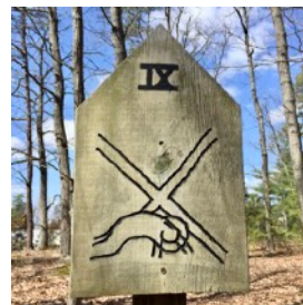
9. His 3 rd Fall