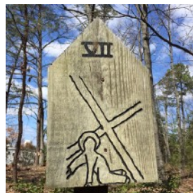
7. His 2 nd Fall