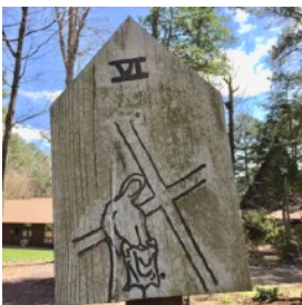
6. Christ's face is wiped by Veronica