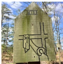
13. His body is taken from the cross