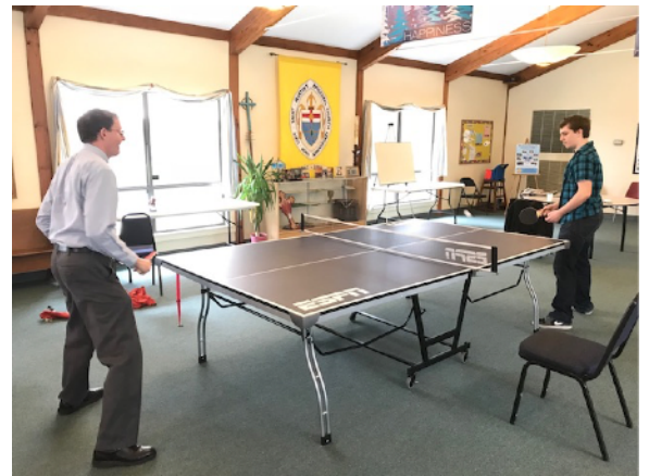
Meeting March 11