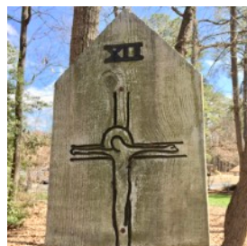
12. Christ dies on the cross