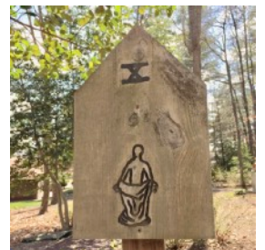
10. He is stripped of his Garments