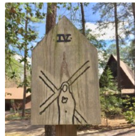
4. He meets his mother