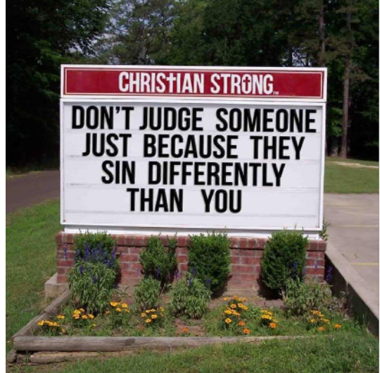
As seen on FaceBook!