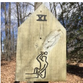
11. He is nailed to the cross