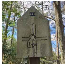
2. Christ receives the cross.