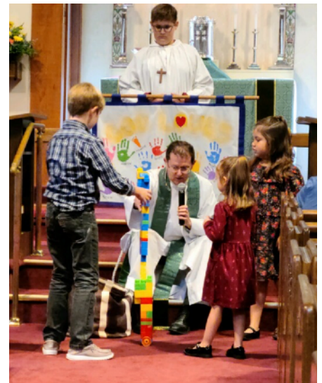
the Children's Message.

If you know of somebody not on these lists (including yourself) please let the office know.