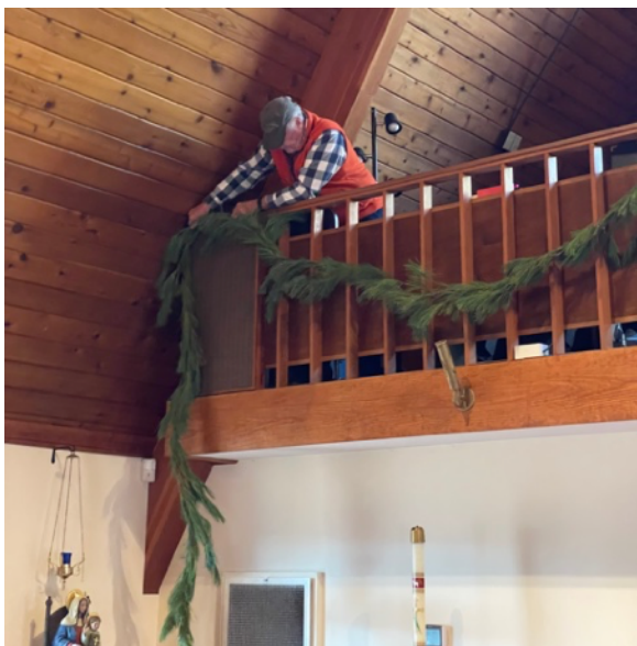
More photos from Saturday November 27: getting the church ready for the Advent time.