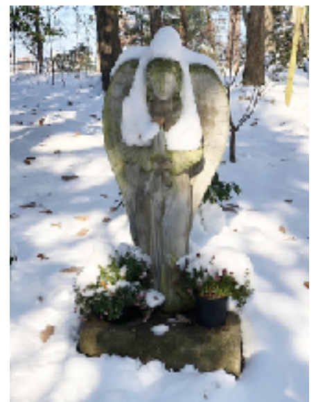
The great snow of 2018