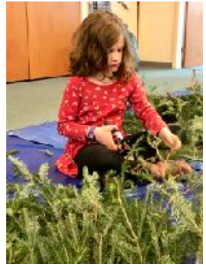
The youngest participants took their work of providing the short branches very seriously. Great job!