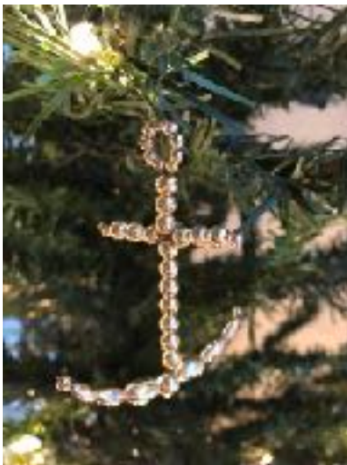
(The Anchor is a 3-D ornament and difficult to photograph.)

The Chrismon workshop also had to be postponed to the following Sunday and three new Chrismons were added when they were finished.