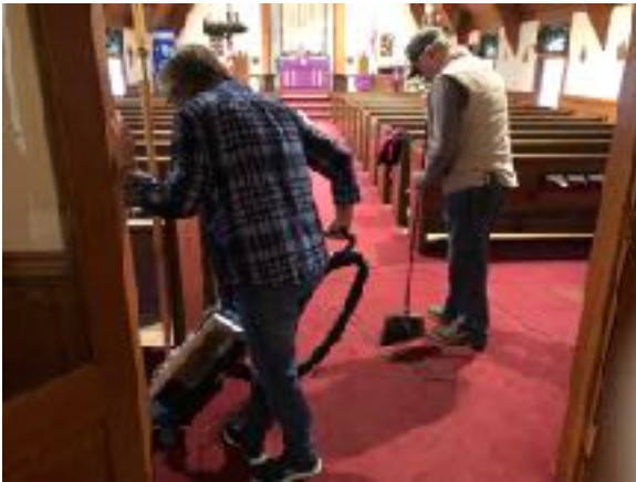
I was too late to take photos of the Greening of the Church. EYC and Altar Guild decorated the Chrismon Tree, hung the Advent Wreath and made St. Martin's festive.