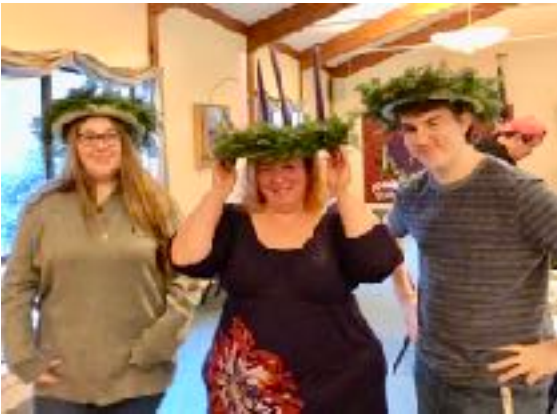
The (second annual) Advent Wreath workshop was again a lot of fun and fellowship enjoyed by all. Participants were happy to take home their successful projects.