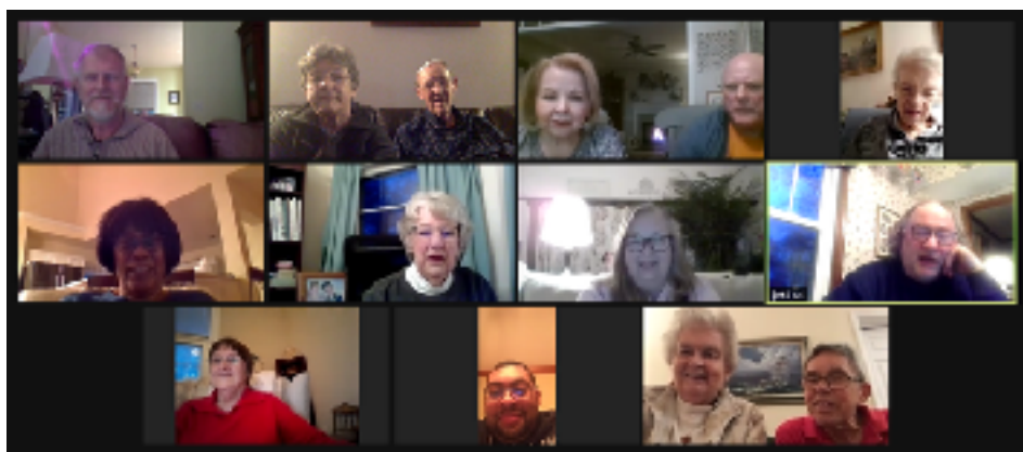
A fun zoom time on February 11.