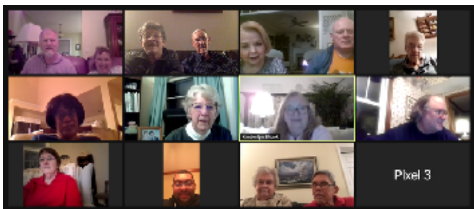
There are always some "regulars" who try not to miss it but also different members almost every Thursday.