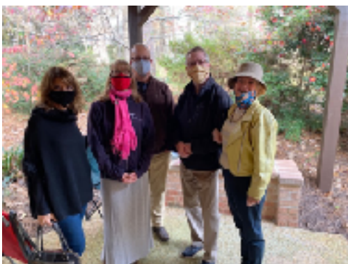
And getting ready for the streamed service afterwards.