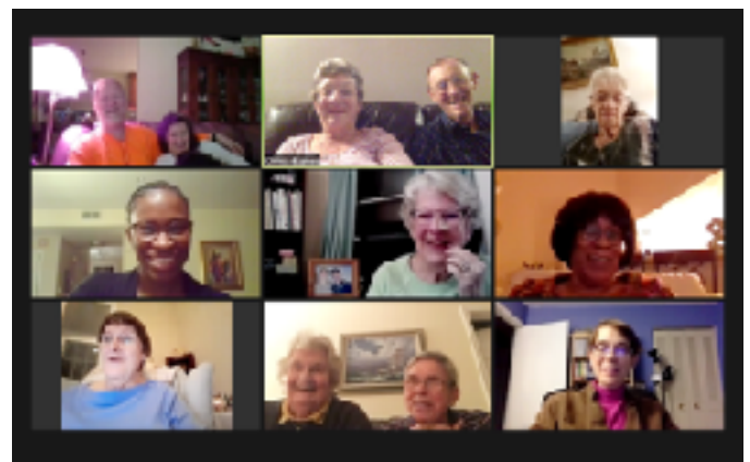
Zoom meeting November 11

Friends are checking in and out if they can't be there the whole 40 minutes. It's nice to sometimes just they 'hello' to the friends we are missing so much.