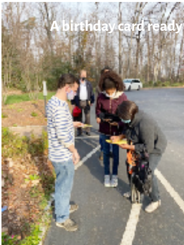
A birthday card ready