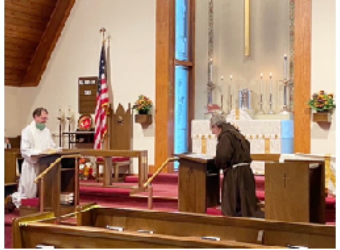
November 1 - All Saints day A special soloist at the virtual service. And the reading of the names of those we have lost. If you missed it, you can still find it on FaceBook.