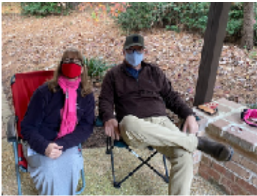
Service getting ready to start.

Services continued... from previous page