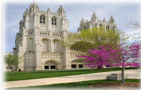
Washington, DC Cathedral