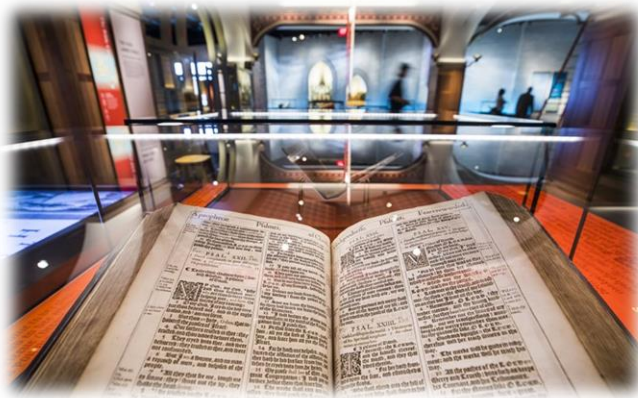
Visit the World Famous Museum of the Bible

Cost: $25 per person $75 per family box brunch included